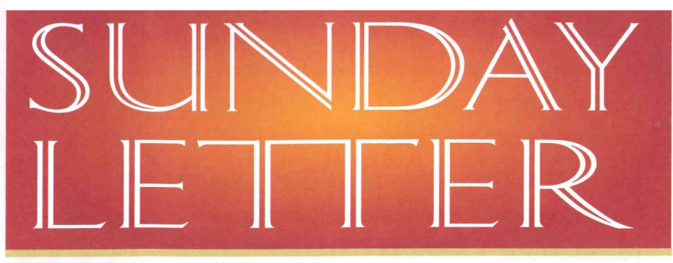
Series: Jesus: Human & Divine : Third Sunday of Easter, Year B, 14th April 2024

Firstly, Jesus is present in the words of Scripture as they are read aloud in the